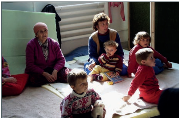
Refugees from Kosovo in one of NG's makeshift camps

Albania's willingness to take in so many people in danger and need "is something that Albania can always be proud of."