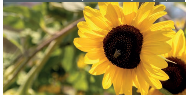
The sunflower - NG's symbol for growth and fruit