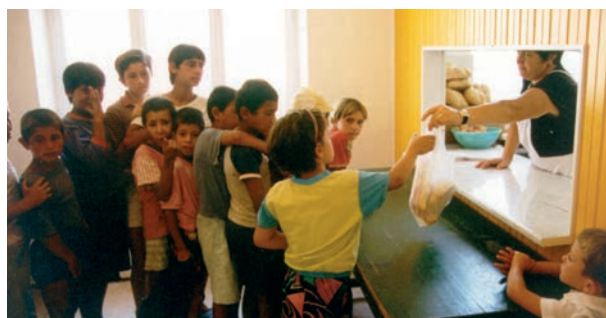
1996: Soup kitchen for needy children