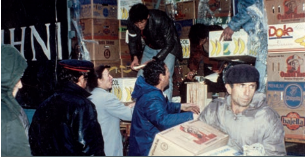
Operation 24 - 24,000 aid parcels for every family in Pogradec