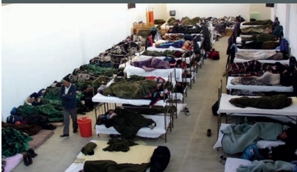
The church became a shelter for hundreds of refugees.