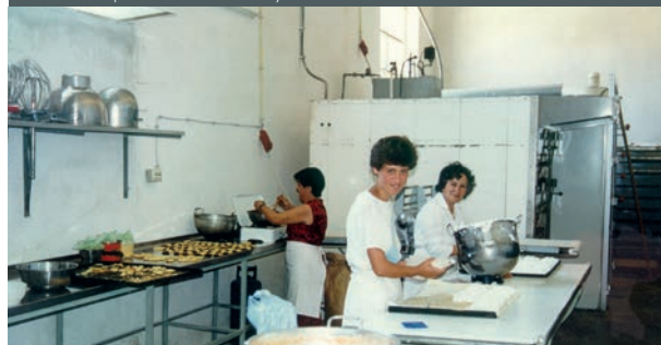
Nehemia's model bakery in 1996