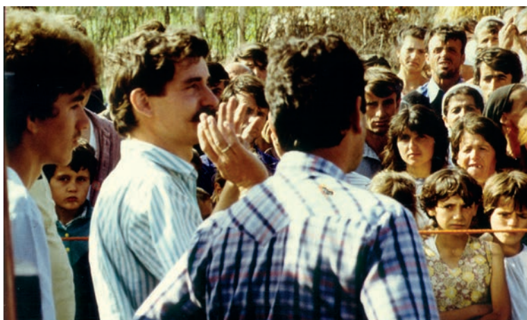
Albania 1991: People are longing for food - and for orientation in a confusing new world.