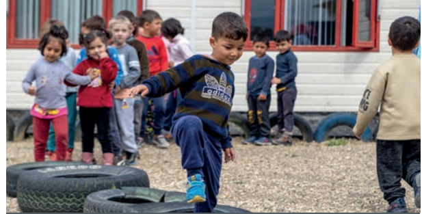
Kindergarten kids have fun at Amaro Tan School.