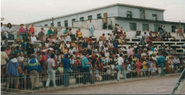
Daily prayer meetings in the handball stadium