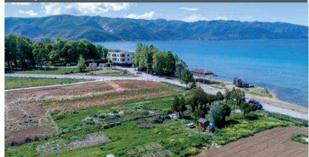
Beautiful Lake Ohrid and the organic permaculture gardening project