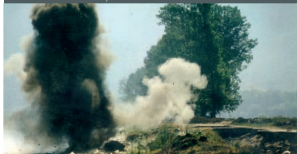
Bombs explode during the national unrest in 1997