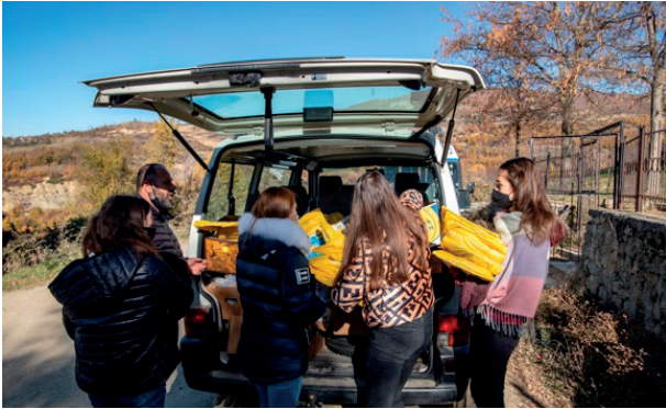
Students of Nehemia School distributing aid in the villages

Supporting Tanzanian teachers inspired the idea of collective giving on the part of NG coworkers in Albania. This year, when the team began planning the annual intermural volleyball tournament, they decided to make it a fundraiser. Registration fees were pooled and donated to a Pogradec family in need through the Amaro Tan Center. The first five registrants got to pick the family. The Administration team won the tournament, beating out Facilities—and, most importantly, everybody had a great time.