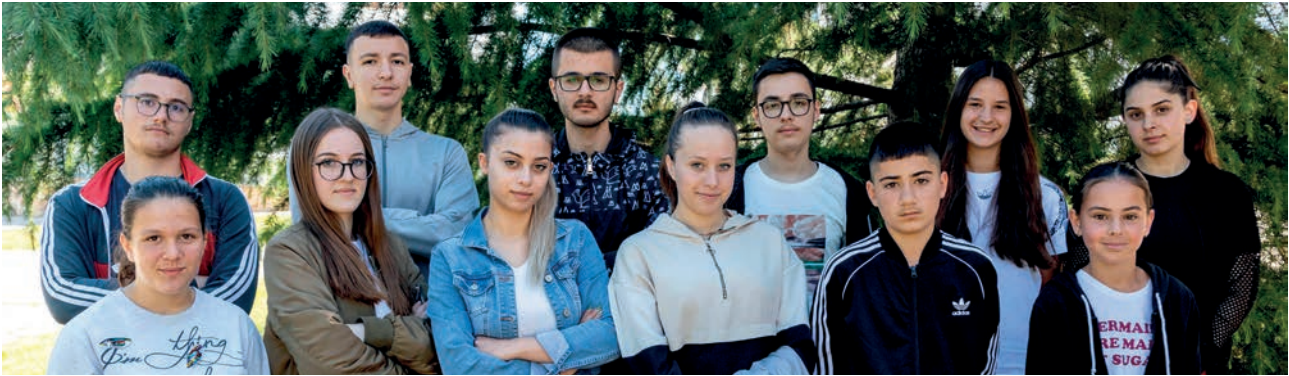
Nehemia School's student council

For older generations of Albanians, “volunteering” has negative connotations. Under the communist regime that ruled the country until 1991, volunteer work was compulsory and unpaid—and, if you did not show up for your assignment, the consequences for you and your family could be both serious and long-lasting. For that reason, in building a culture of volunteerism at NG, we have been careful to create situations where volunteers choose their projects and choose to participate.