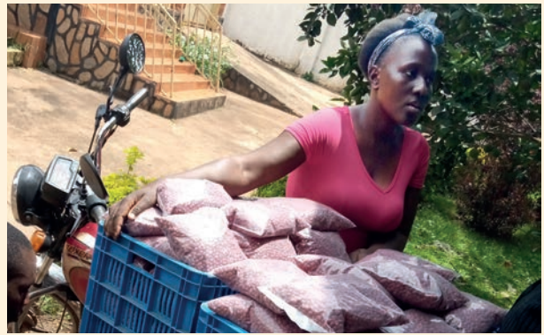
Shipping produce the African way