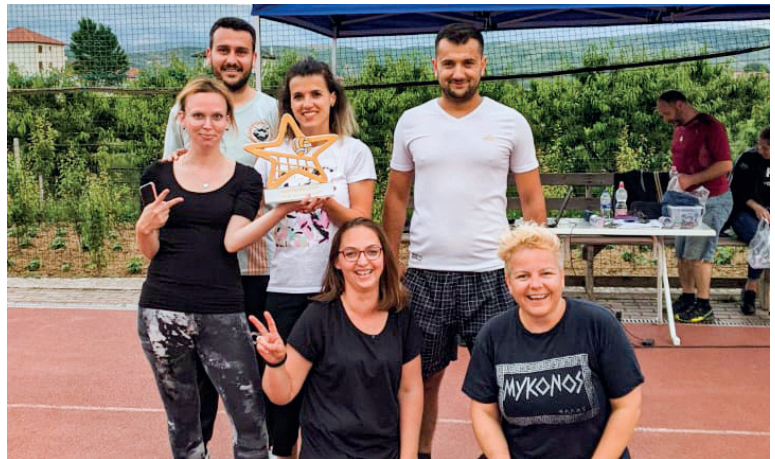
„Team Administration“ - winners of a charity match for the benefit of a family in need